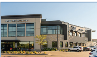
MAPLE GROVE 763-302-4114