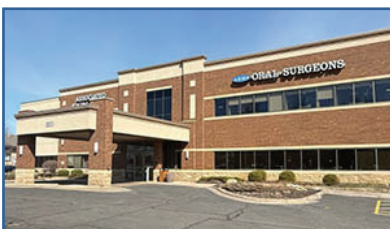
COON RAPIDS 763-427-8320