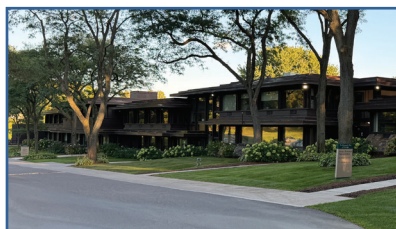
GOLDEN VALLEY 763-588-0661

Referrals are required for visits at our Golden Valley and Maple Grove clinics.